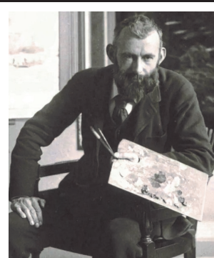
W. L. WYLLIE The most distinguished Martine Artist of his day

Walk in the footsteps of Wyllie and see where he was inspired to paint! Walk Length: 3.9 miles Duration: circa 1 hr and 20 minutes Conditions: Varied with Tidal Sections Start Point Postcode: ME3 9AZ